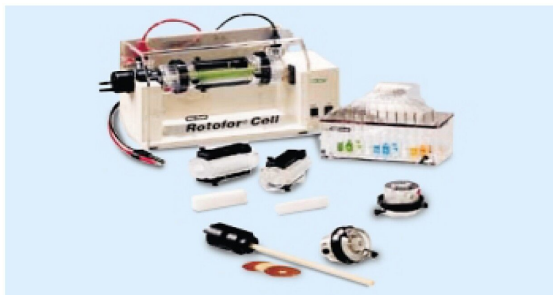
Figure 1. Rotofor apparatus with components were used to perform isoelectric focusing in liquid phase.

Gel eluter fractions were dried to a volume of 200 \mu L. 600 \mu L of ice cold acetone was added and the samples were incubated in freezer for 2 hrs. The samples were centrifuged and dried after the supernatant was removed. The proteins were dissolved in digestion buffer (0.1 mM \text{CaCl}_2 , 0.1 M \text{NH}_4\text{HCO}_3 ) and 10 \mu L of trypsin (10 ng/ \mu L) was added followed by incubation at 37 ^{\circ} C for 4 hrs. The samples were dried and dissolved in 25 \mu L TFA (0.1%).