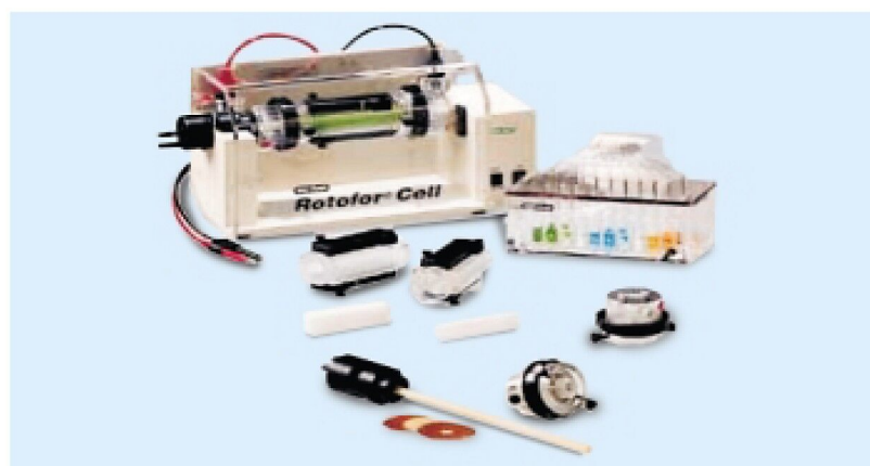
Figure 1. Rotofor apparatus with components were used to perform isoelectric focusing in liquid phase.

Gel eluter fractions were dried to a volume of 200 \mu L. 600 \mu L of ice cold acetone was added and the samples were incubated in freezer for 2 hrs. The samples were centrifuged and dried after the supernatant was removed. The proteins were dissolved in digestion buffer (0.1 mM \text{CaCl}_2 , 0.1 M \text{NH}_4\text{HCO}_3 ) and 10 \mu L of trypsin (10 ng/ \mu L) was added followed by incubation at 37 ^{\circ} C for 4 hrs. The samples were dried and dissolved in 25 \mu L TFA (0.1%).