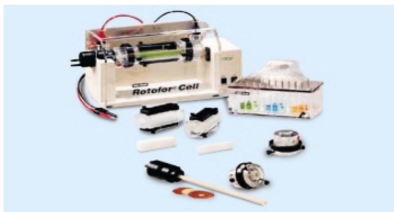
Figure 1. Rotofor apparatus with components were used to perform isoelectric focusing in liquid phase.

Gel eluter fractions were dried to a volume of 200 \mu L. 600 \mu L of ice cold acetone was added and the samples were incubated in freezer for 2 hrs. The samples were centrifuged and dried after the supernatant was removed. The proteins were dissolved in digestion buffer (0.1 mM \text{CaCl}_2 , 0.1 M \text{NH}_4\text{HCO}_3 ) and 10 \mu L of trypsin (10 ng/ \mu L) was added followed by incubation at 37 °C for 4 hrs. The samples were dried and dissolved in 25 \mu L TFA (0.1%).