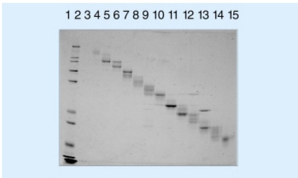
Figure 3. Proteins from Rotofor fraction 3, eleuted with the Mini Whole gel eluter were visualised by the NuPAGE system. Lane 1: Molecular weight standard, lanes 2-15 contains fractions 3:1-3:14. Fractions 3, 7, 15 (with pH 3, 5, 7) repectively, were analysed using MALDI TOFMS, ESI qTOF MS/MS and bioinformatics. Proteins identifications as listed in Table 1.