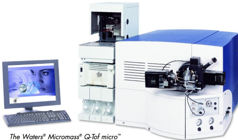
The Waters® Micromass® Q-Tof micro™ mass spectrometer.

The Waters Micromass Q-Tof micro Mass Spectrometer.