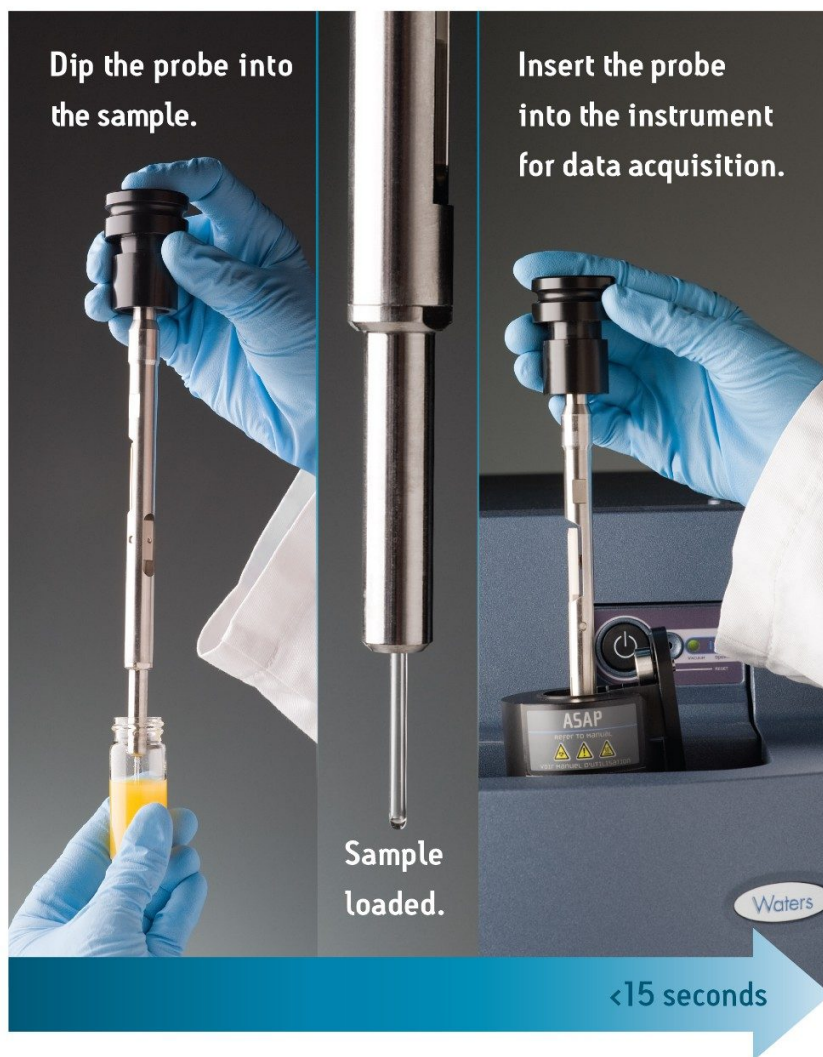
Figure 1. The sample is loaded directly onto the tip of a glass capillary. The sample is then directly inserted into the ionization source chamber. Bulk MS data are collected in seconds.