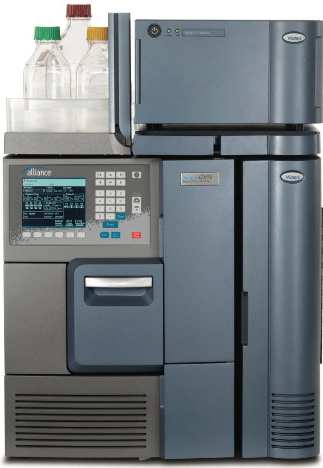
Figure 1. Alliance HPLC System with ELS detector.