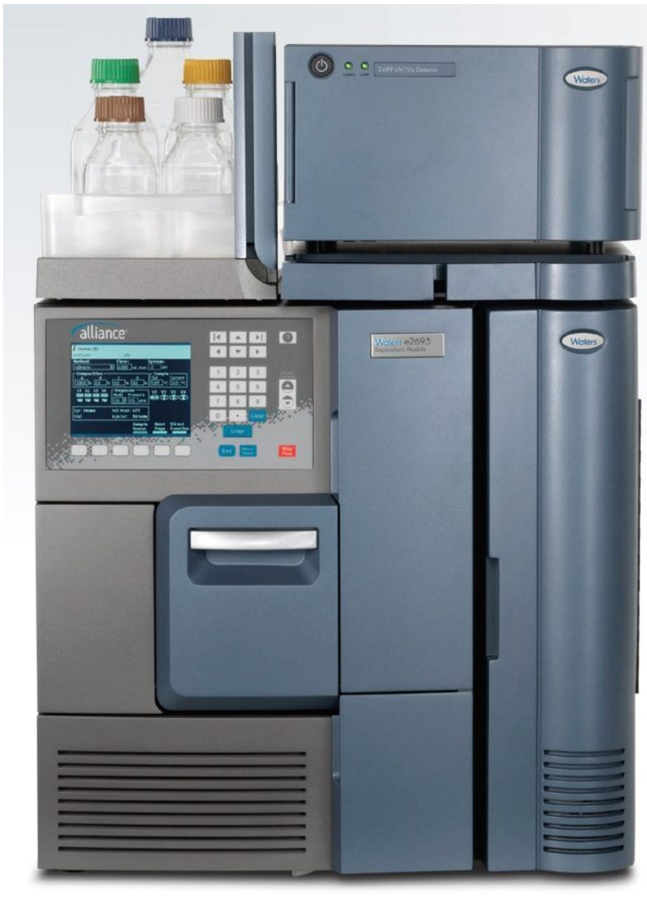
Figure 1. Alliance HPLC System with 2489 UV/Vis Detector.

The separation of the budesonide standard was run using the XBridge C 18 4.6 x 150 mm, 5 μ