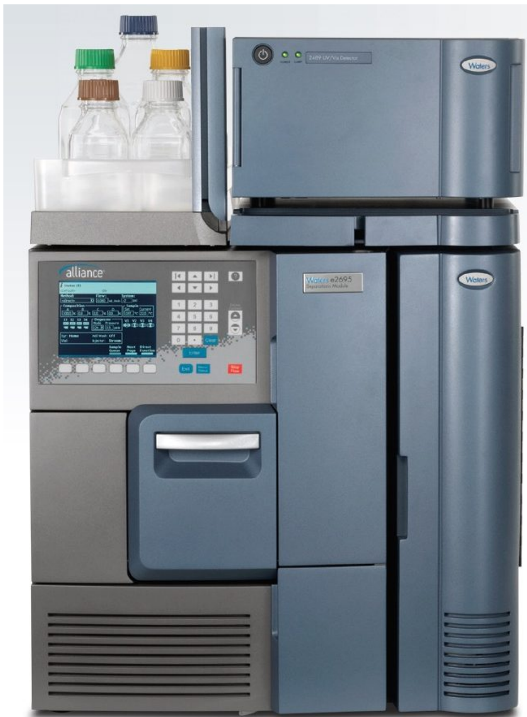
Figure 1. Alliance