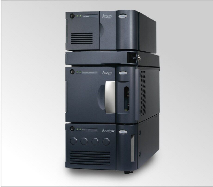
Figure 1. ACQUITY UPLC H-Class System with PDA Detector.

Figure 2 shows the separation of all dyes using the ACQUITY UPLC H-Class System with PDA Detector. The standard curves for all compounds were prepared over the concentration range of 2 to 40 \mu\text{g}/\text{mL} . Excellent linearities ( r^2 > 0.999 ) were achieved for all compounds. Example calibration curves for two of the compounds (P4R and brilliant black) are shown in Figure 3.