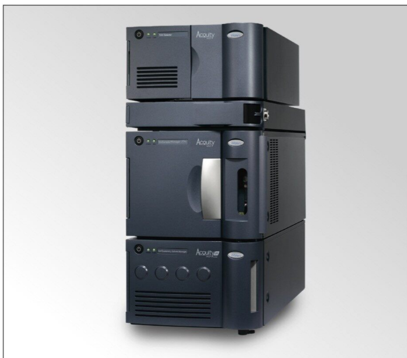
Figure 1. ACQUITY UPLC H-Class System with PDA Detector.

The separation of 13 synthetic dyes (permitted and non-permitted) was achieved using Waters ACQUITY UPLC H-Class System, shown in Figure 1, in less than eight minutes. Separation was performed on an ACQUITY UPLC BEH C 18 2.1 x 100 mm, 1.7 μm Column using 30 mM ammonium acetate, methanol, and acetonitrile gradient, as shown in Figure 2. The ACQUITY UPLC H-Class, a quaternary UPLC system, provides the flexibility of using up to four different solvent lines, which eliminates the need to premix the solvents. PDA detection was programmed to acquire the data at 400 nm for yellow dyes, 500 nm for orange and red dyes, and 630 nm for green and blue dyes. Individual standards of each of the dyes were also used to create a library of UV spectra. The spectra of the dyes detected in foodstuffs can be matched against the library to increase confidence in the identification of those dyes.