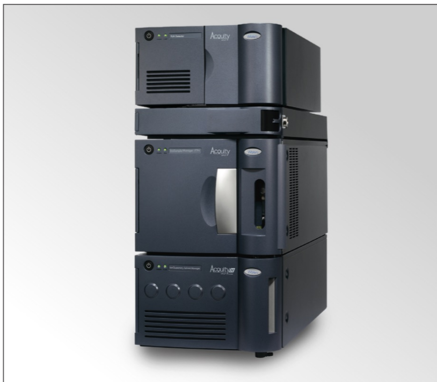
Figure 1. ACQUITY UPLC H-Class System with PDA Detector.

The separation of 13 synthetic dyes (permitted and non-permitted) was achieved using Waters ACQUITY UPLC H-Class System, shown in Figure 1, in less than eight minutes. Separation was performed on an ACQUITY UPLC BEH C 18 2.1 x 100 mm, 1.7 μm Column using 30 mM ammonium acetate, methanol, and acetonitrile gradient, as shown in Figure 2. The ACQUITY UPLC H-Class, a quaternary UPLC system, provides the flexibility of using up to four different solvent lines, which eliminates the need to premix the solvents. PDA detection was programmed to acquire the data at 400 nm for yellow dyes, 500 nm for orange and red dyes, and 630 nm for green and blue dyes. Individual standards of each of the dyes were also used to create a library of UV spectra. The spectra of the dyes detected in foodstuffs can be matched against the library to increase confidence in the identification of those dyes.