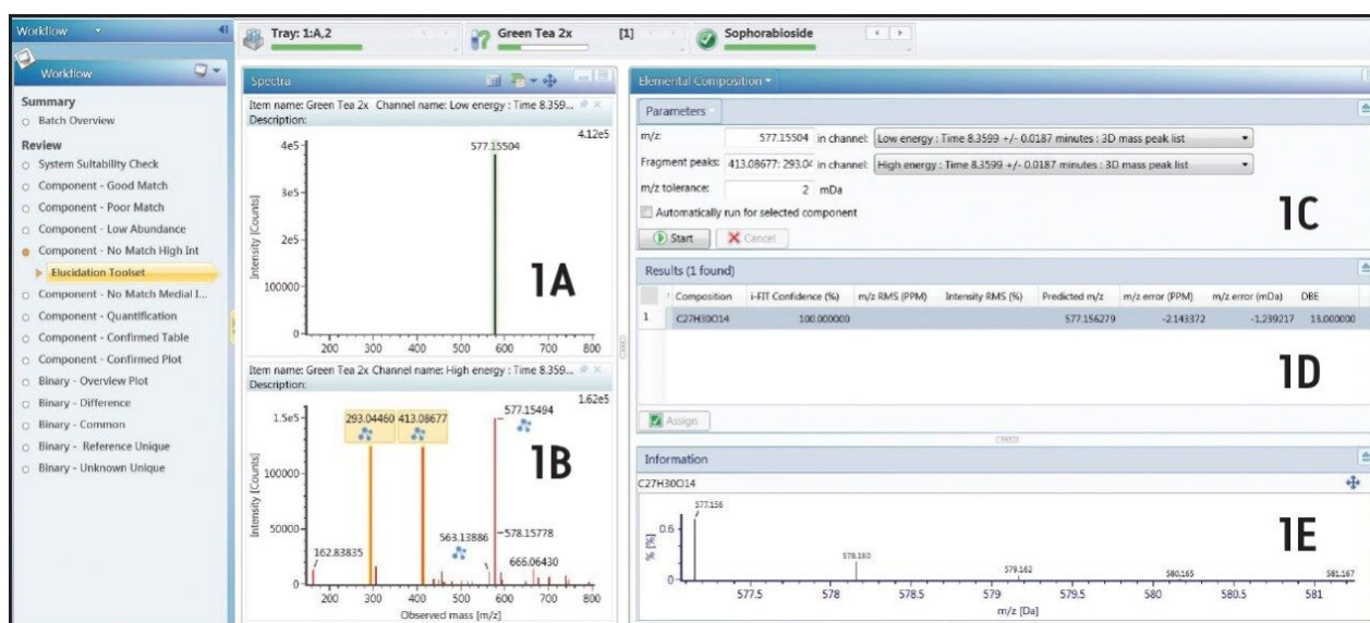
Figure 1. The process of an unknown component's elemental composition determination. 1A: Low collision energy mass spectrum of the unknown component. 1B: High collision energy mass spectrum of the unknown component. 1C: Settings for elemental composition search. 1D: Search results of the unknown component's elemental composition. 1E: Isotope distribution plot for the unknown sample.

As shown in Figure 1, for the unknown component with an accurate mass of 577.1550, we can obtain the only possible elemental composition combining the above three factors: C 27 H 30 O 14 (assuming this natural product is only composed of C, H, and O).