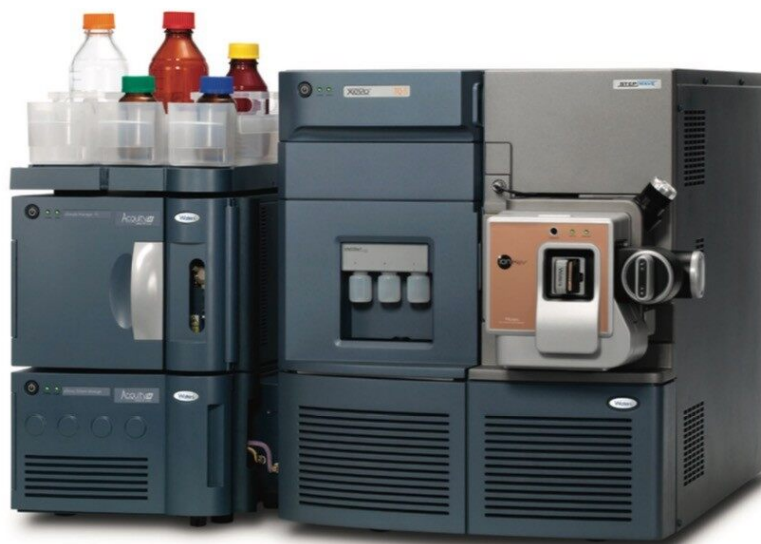
Figure 1. ionKey/MS System: comprised of the Xevo TQ-S, the ACQUITY UPLC M-Class, the ionKey source and the iKey separation device.