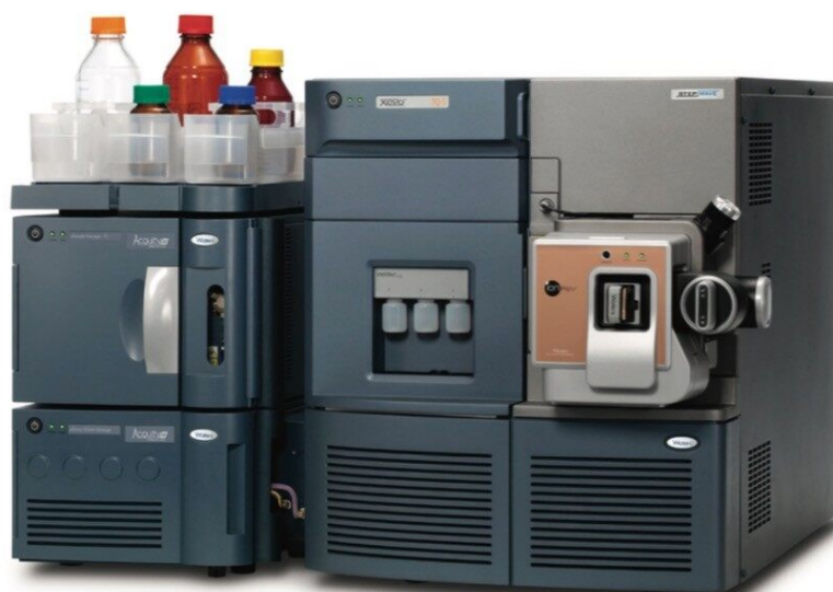
Figure 1. ionKey/MS System: comprised of the Xevo TQ-S, the ACQUITY UPLC M-Class, the ionKey source and the iKey separation device.