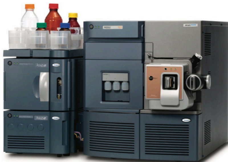
Figure 1. ionKey/MS System: comprised of the Xevo TQ-S, the ACQUITY UPLC M-Class, the ionKey source and the iKey separation device.