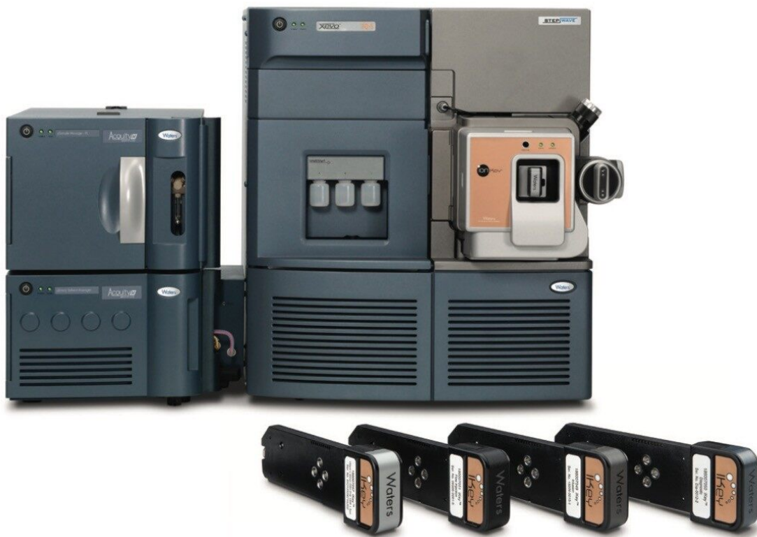
Figure 1. ionKey/MS System: comprised of the Xevo TQ-S, the ACQUITY UPLC M-Class, the ionKey source and the iKey separation device.

Figure 2 illustrates the separation of a peptide standard utilized in the evaluation of the system. As can be observed in Figure 2, the overlay of fifteen different analysis of the peptide standard illustrates the excellent reproducibility of the ionKey system. The data from this evaluation is further displayed in Table 1. The data illustrates average retention times of 6.84 minutes for the peptide standard with 0.1 % RSD. In this evaluation, the peptide standard data was acquired over a course of 500 injections of rat plasma prepared via protein precipitation, utilizing a 15 minute gradient equating to five days of continuous operation.