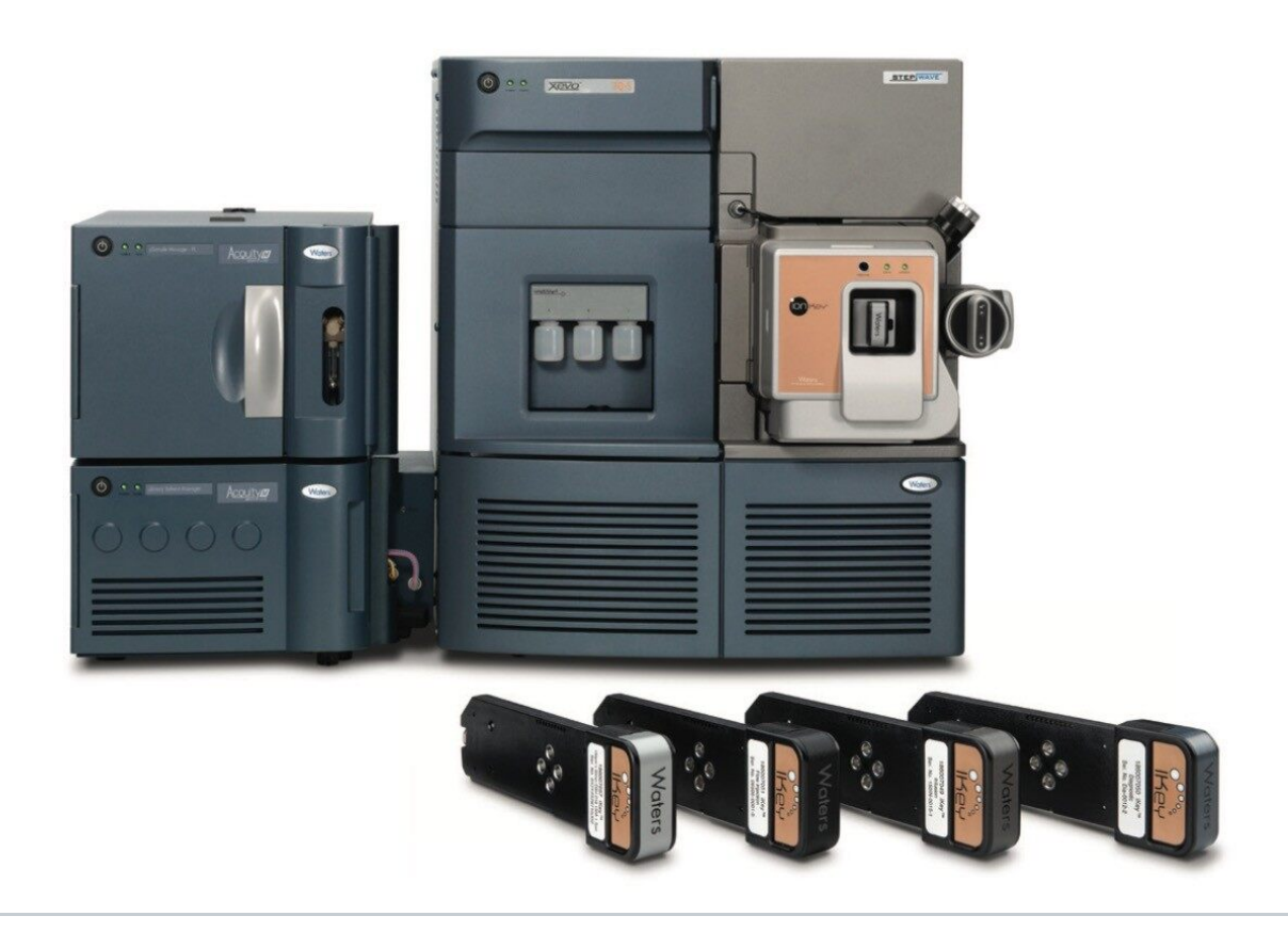
Figure 1. ionKey/MS System: comprised of the Xevo TQ-S, the ACQUITY UPLC M-Class, the ionKey source and the iKey separation device.

Figure 2 illustrates the separation of a peptide standard utilized in the evaluation of the system. As can be observed in Figure 2, the overlay of fifteen different analysis of the peptide standard illustrates the excellent reproducibility of the ionKey system. The data from this evaluation is further displayed in Table 1. The data illustrates average retention times of 6.84 minutes for the peptide standard with 0.1 % RSD. In this evaluation, the peptide standard data was acquired over a course of 500 injections of rat plasma prepared via protein precipitation, utilizing a 15 minute gradient equating to five days of continuous operation.