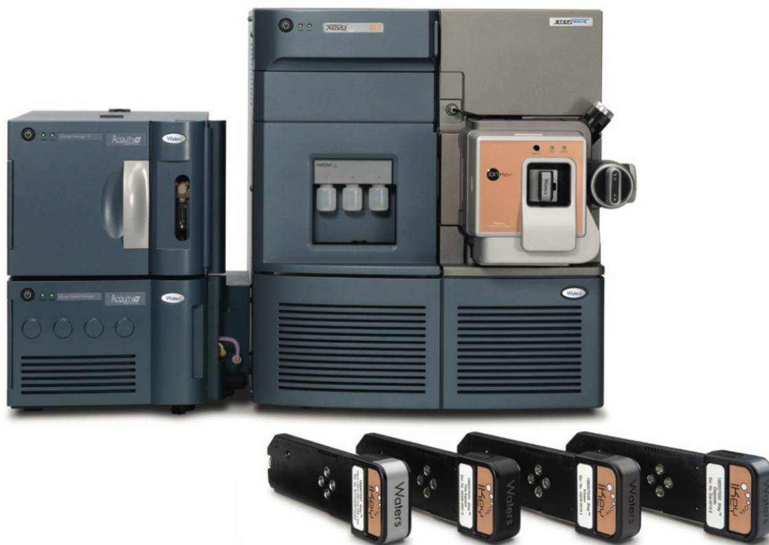
Figure 1. ionKey/MS System: comprised of the Xevo TQ-S, the ACQUITY UPLC M-Class, the ionKey source and the iKey separation device.

The ionKey/MS System, shown in Figure 1, integrates the UPLC separation directly into the source of the mass spectrometer. The system combines the ACQUITY UPLC M-Class and the Xevo TQ-S Tandem Quadrupole Mass Spectrometer with the iKey Separation Device. The iKey consists of the ceramic-based separations channel, packed with UPLC grade particles, an integrated emitter, fluidic connections, electronics, ESI interface, heater, and e-cord. Once inserted into the source, all fluidic connections are made through the turn of a handle thereby creating a true “plug and play” capillary LC-MS instrument.