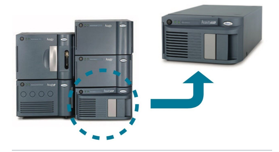
Figure 1. The ACQUITY QDa Detector. The compact footprint of the ACQUITY QDa allows for easy integration into existing instrument stacks. Its plug-and play design allows for the implementation of complementary orthogonal detection techniques with minimal effort into a single integrated system and workflow.

The objective of this application is to demonstrate the use of the ACQUITY QDa Detector as a complementary orthogonal detection technique that enables the integration of optical (UV) and basic mass spectral data within a single workflow using a known peptide mixture.