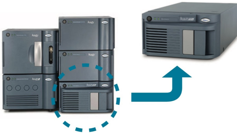
Figure 1. The ACQUITY QDa Detector. The compact footprint of the ACQUITY QDa allows for easy integration into existing instrument stacks. Its plug-and-play design allows for the implementation of complementary orthogonal detection techniques with minimal effort into a single integrated system and workflow.

The objective of this application is to demonstrate the use of the ACQUITY QDa Detector as a complementary orthogonal detection technique that enables the integration of optical (UV) and basic mass spectral data within a single workflow using a known peptide mixture.