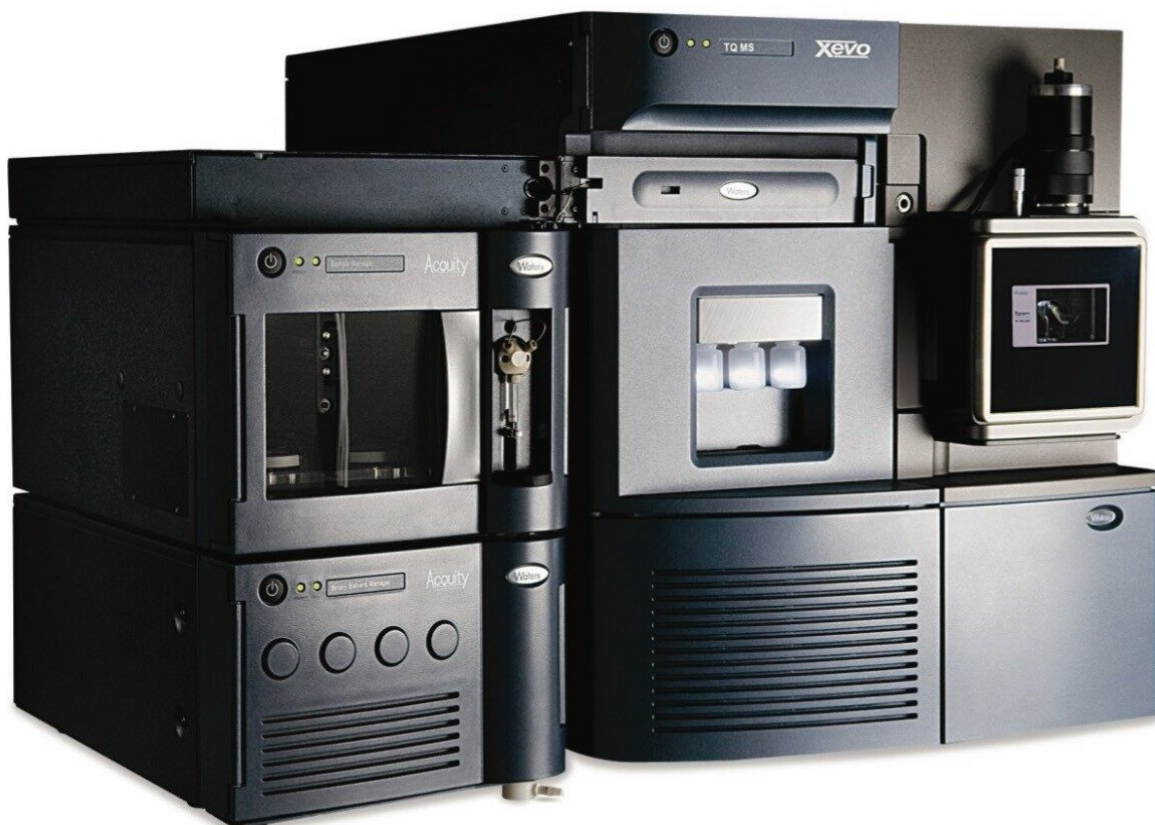
Figure 1. ACQUITY UPLC with Xevo TQ MS.