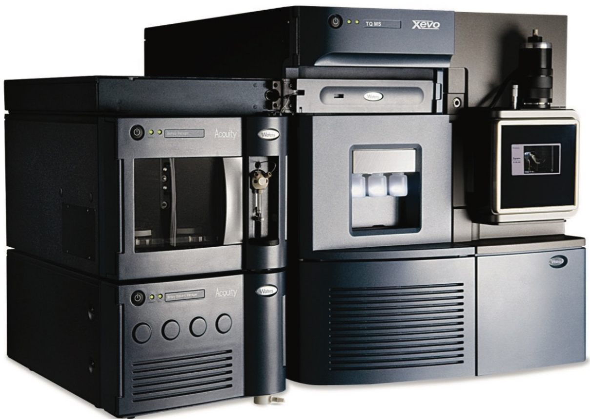
Figure 1. ACQUITY UPLC with Xevo TQ MS.