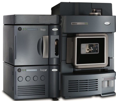
Figure 1. The Waters ACQUITY UPLC I-Class and Xevo TQD.

TQD Mass Spectrometer (Figure 1). In addition, we have evaluated External Quality Assessment (EQA) samples for testosterone, androstenedione, and DHEAS to evaluate the bias and therefore suitability of the method for analyzing testosterone, androstenedione, and DHEAS for clinical research.