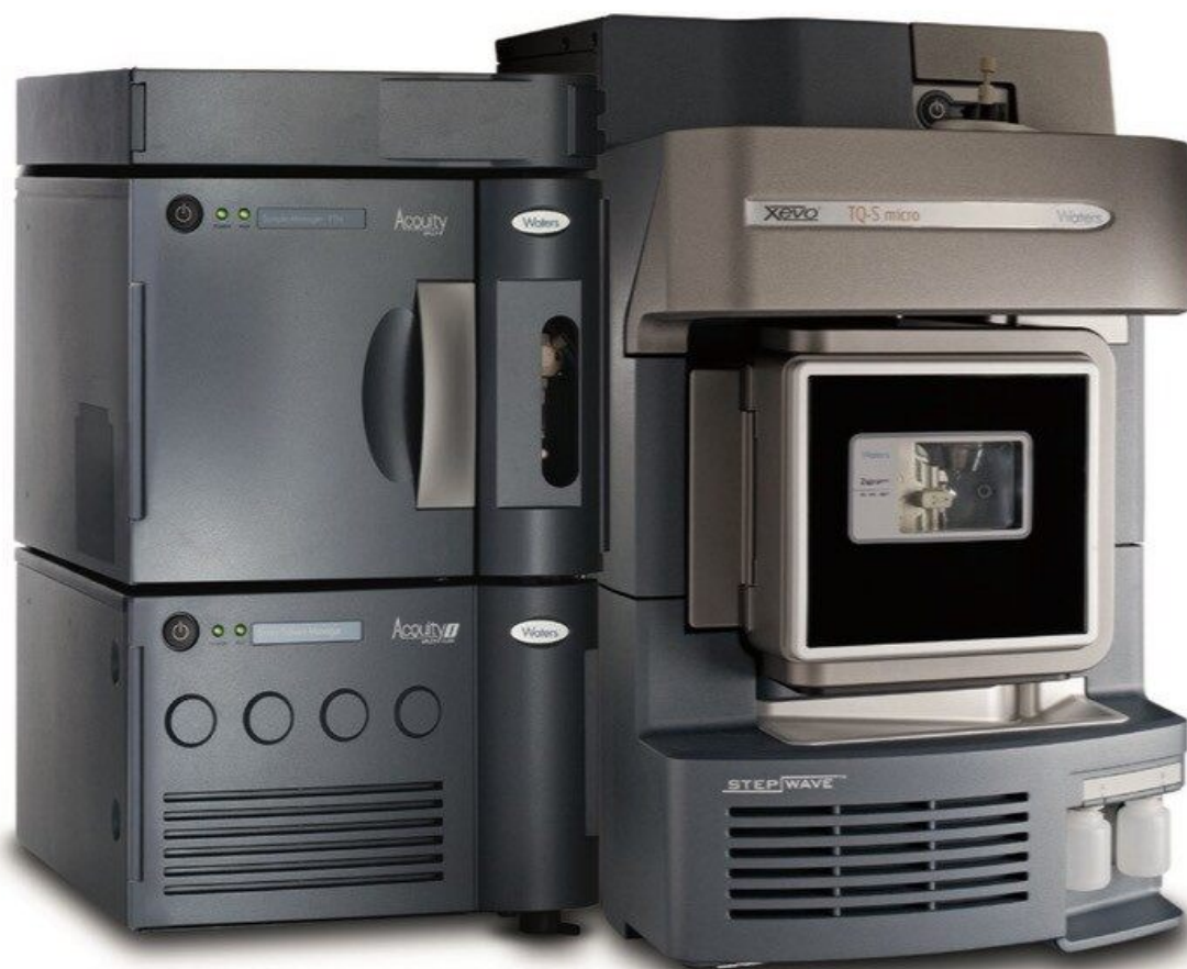
Figure 1. ACQUITY UPLC I-Class and Xevo TQ-S micro configuration.

Combining the ACQUITY UPLC I-Class with the Xevo TQ-S micro allows this established UPLC-MS/MS screening methodology to be used on the latest generation of Waters mass spectrometers.