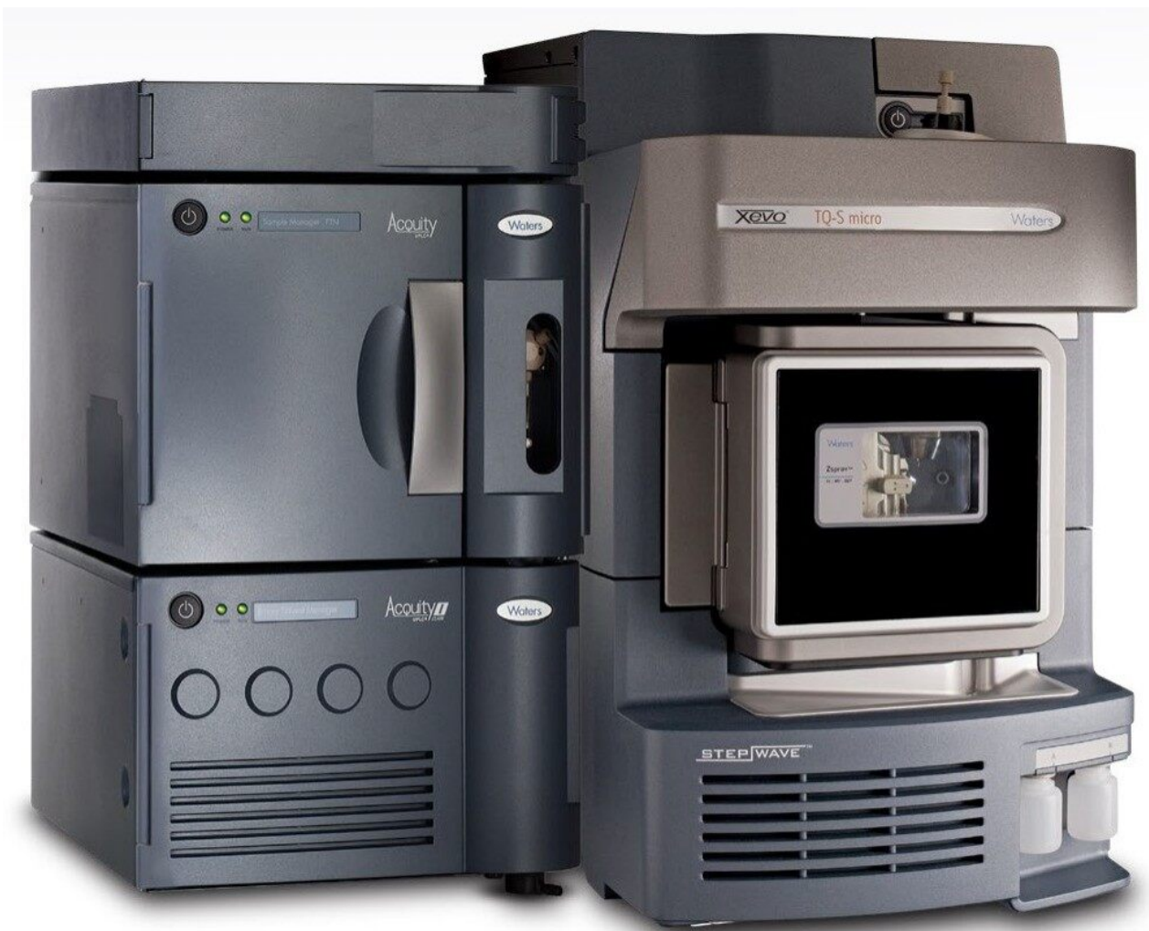
Figure 1. ACQUITY UPLC I-Class System and Xevo TQ-S micro.

The technique uses in-source collision induced fragmentation at various cone voltages followed by library matching using the ChromaLynx Application Manager. Previous analysis of mixtures of drug substances using the Xevo TQ-S micro indicated that the cone voltages required to produce comparable fragmentation patterns were higher than those used with the previous generation mass spectrometers (e.g. Xevo TQD), therefore modified libraries were prepared and evaluated. Figure 2 shows a comparison of spectra obtained on the two platforms, highlighting the additional 30 V applied to the cone for each function on the Xevo TQ-S micro.