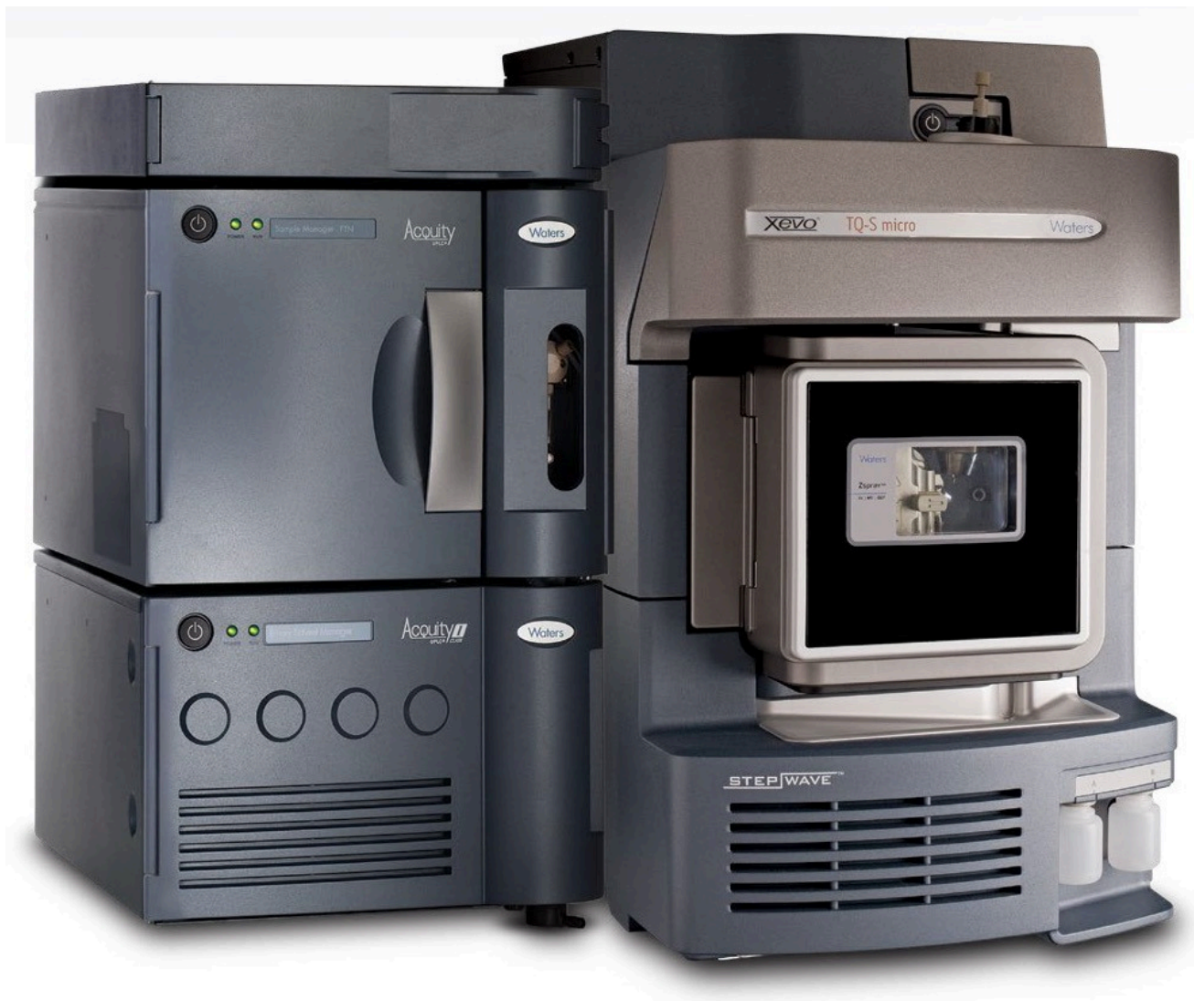
Figure 1. ACQUITY UPLC I-Class System and Xevo TQ-S micro.

The technique uses in-source collision induced fragmentation at various cone voltages followed by library matching using the ChromaLynx Application Manager. Previous analysis of mixtures of drug substances using the Xevo TQ-S micro indicated that the cone voltages required to produce comparable fragmentation patterns were higher than those used with the previous generation mass spectrometers (e.g. Xevo TQD), therefore modified libraries were prepared and evaluated. Figure 2 shows a comparison of spectra obtained on the two platforms, highlighting the additional 30 V applied to the cone for each function on the Xevo TQ-S micro.