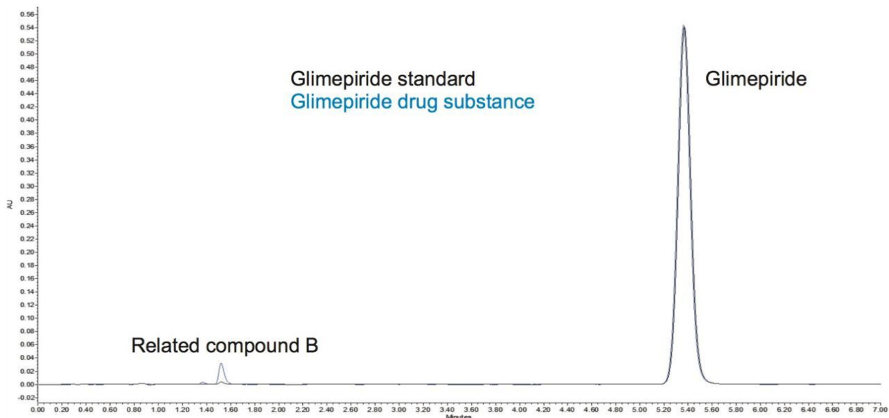
Figure 3. Overlay of standard and sample chromatograms on the Alliance HPLC system, performed using the scaled column dimensions. Blue chromatogram is the sample, black chromatogram is the standard.

As mentioned previously, the active pharmaceutical substance of glimepiride was analyzed using the scaled assay for glimepiride (Figure 3). The percentage of glimepiride was found to be 99.67%. This value was calculated by using the formula found in the USP monograph.