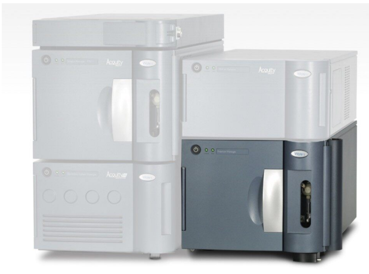
Figure 1. The Waters Fraction Manager - Analytical (WFM-A) System. The specific design of the WFM-A facilitates integration into existing Waters UPLC platforms for efficient collection of narrow and closely eluting compounds with high purity and recovery.

instrument stack and can be controlled using the Waters Empower Chromatography Data Software as shown in Figure 2. The instrument can be programmed to collect fractions in an automated fashion using time, slope, or threshold. In this example, the Collection Event Table was programmed using a processed chromatogram of a commercially synthesized 21-mer siRNA to isolate the parent siRNA from its impurities (Figure 2, green box).