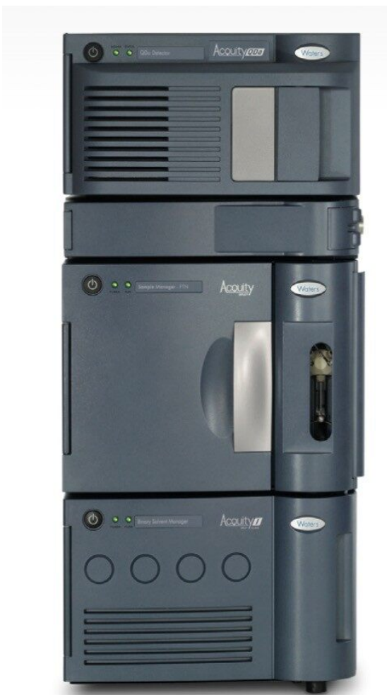
The ACQUITY UPLC I-Class System and ACQUITY QDa Mass Detector.