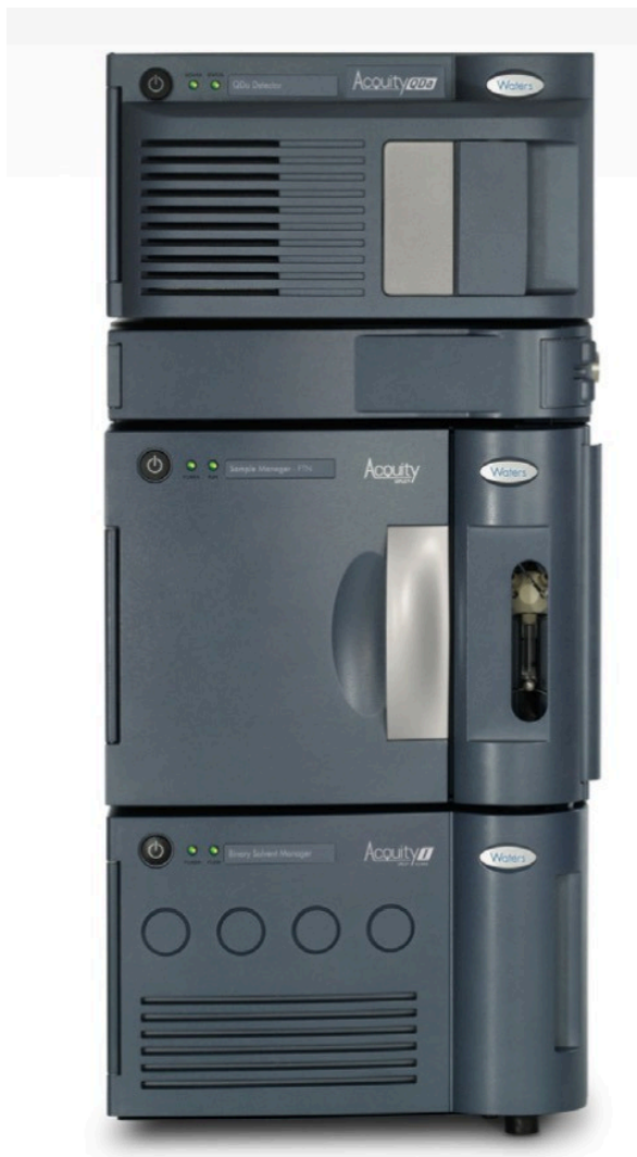
The ACQUITY UPLC I-Class System and ACQUITY QDa Mass Detector.