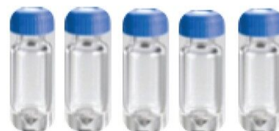
Figure 2. Data from five replicate injections of atorvastatin standard. The upper table is the data of five replicate injections of a sample from the same vial. The lower table is the data collected of five replicate injections from five separate vials with a non-preslit septa (p/n 186000326C), a single injection from each vial. Each run is 115 minutes; the lower table shows the stability of long term storage with proper sample placement.