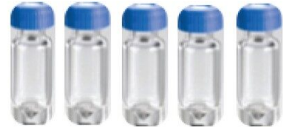
Figure 2. Data from five replicate injections of atorvastatin standard. The upper table is the data of five replicate injections of a sample from the same vial. The lower table is the data collected of five replicate injections from five separate vials with a non-preslit septa (p/n 186000326C), a single injection from each vial. Each run is 115 minutes; the lower table shows the stability of long term storage with proper sample placement.