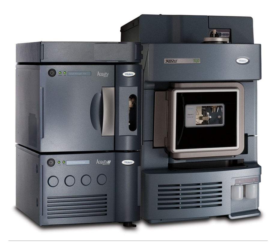
ACQUITY UPLC I-Class/Xevo TQD IVD System.