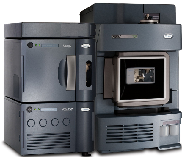
ACQUITY UPLC I-Class/Xevo TQD IVD System.