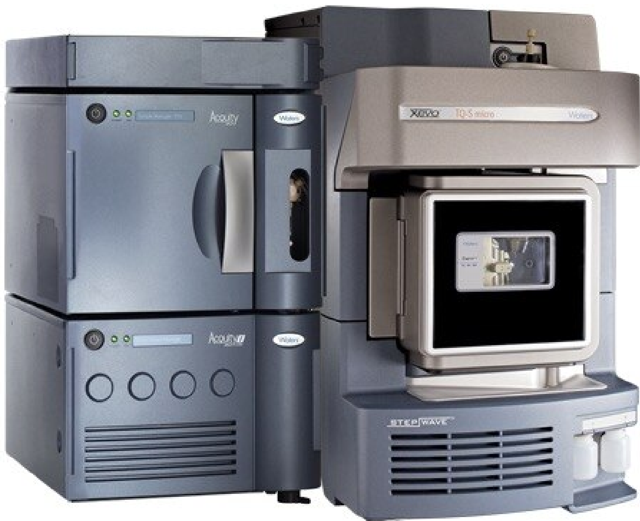
Figure 1. The Waters ACQUITY UPLC I-Class/Xevo TQ-S micro System.

The chromatographic conditions used allowed for the separation of leucine, methylhistidine, alanine and aminobutyric acid isobaric species.