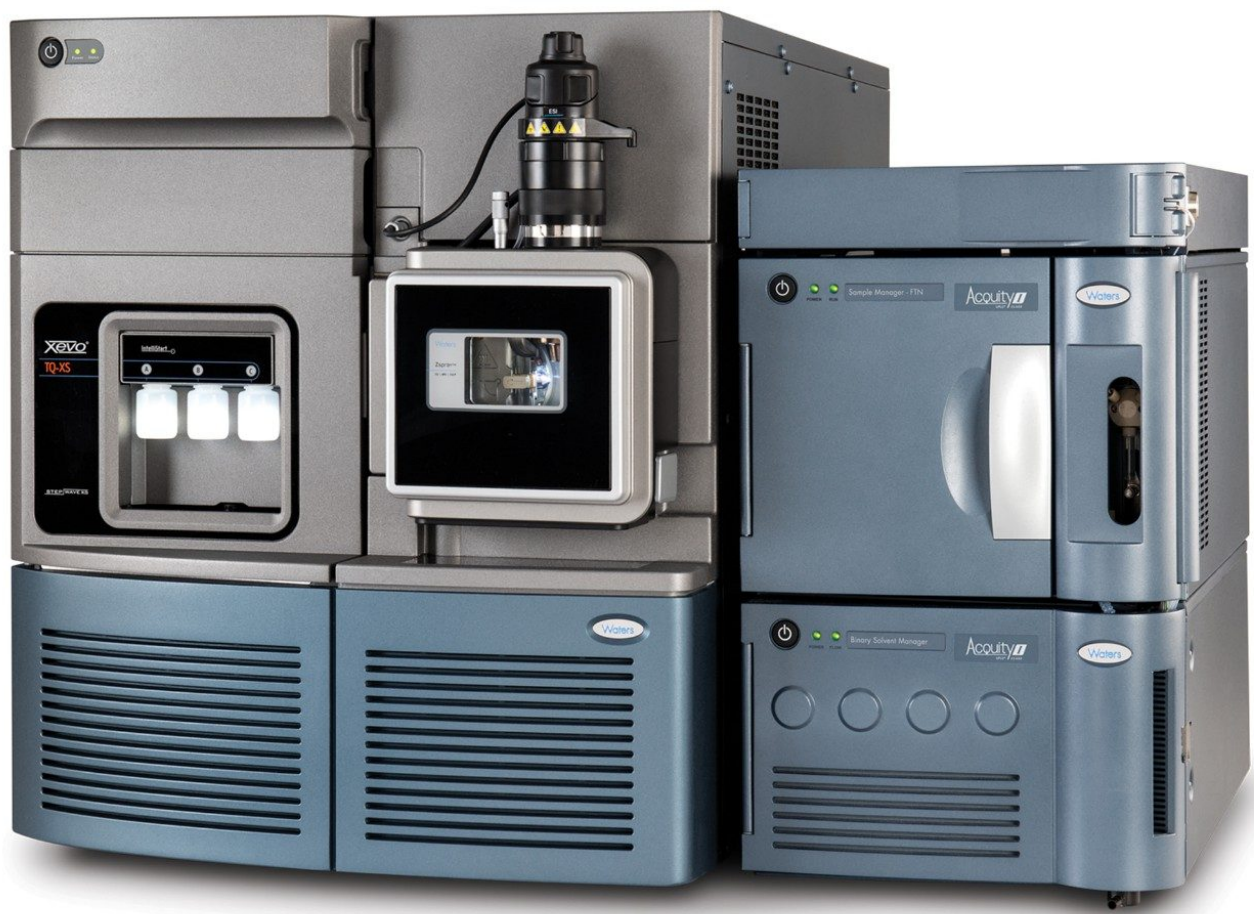
Figure 1. The Waters ACQUITY UPLC I-Class System and Xevo TQ-XS Mass Spectrometer.