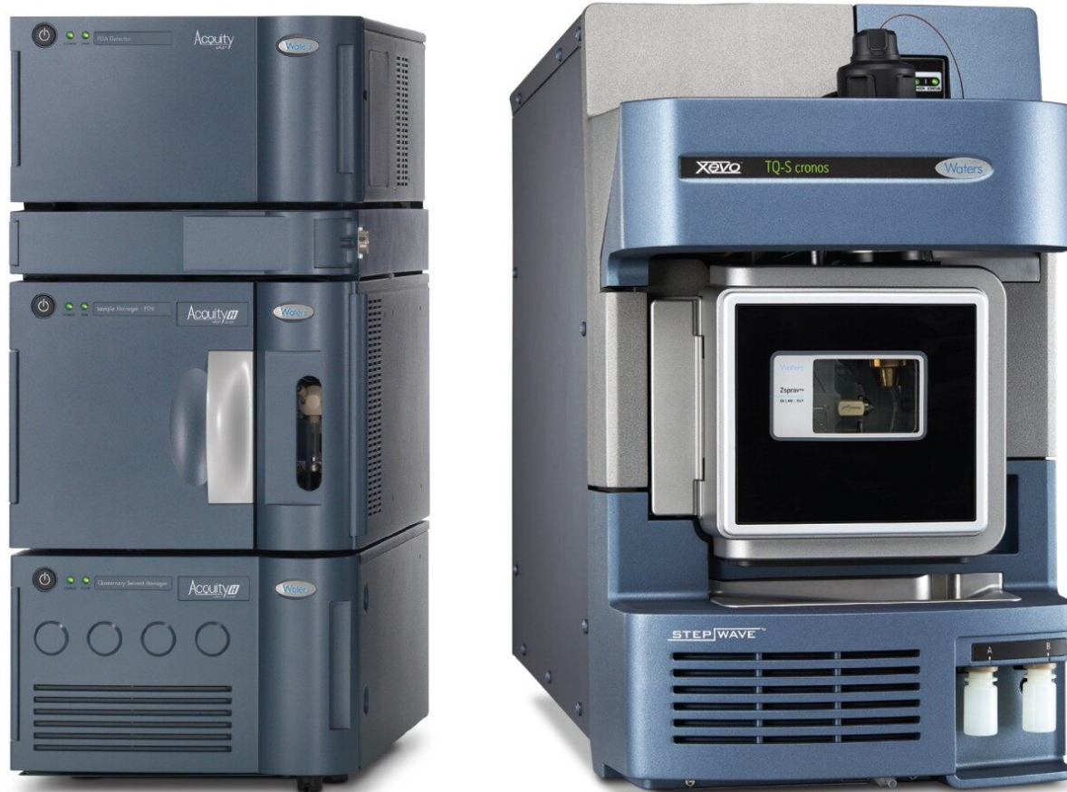
Figure 2. ACQUITY UPLC H-Class PLUS System and Xevo TQ-S cronos Tandem Quadrupole Mass Spectrometer.