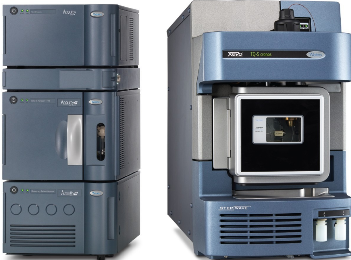
Figure 2. ACQUITY UPLC H-Class PLUS System and Xevo TQ-S cronos Tandem Quadrupole Mass Spectrometer.