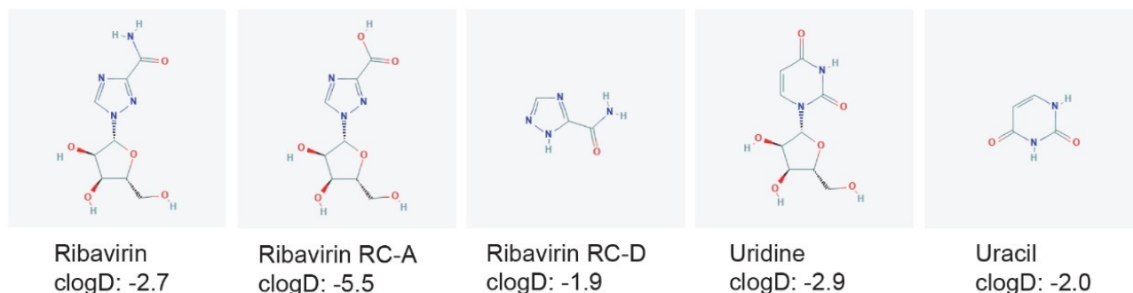
Figure 1. Structure and cLogD values of ribavirin and related compounds. RC (related compound) A and D are either structurally similar or are fragments of ribavirin.

through ionic interactions. 5-7 This provides the opportunity to adjust the interactions to optimize retention, resolution, and peak shape.