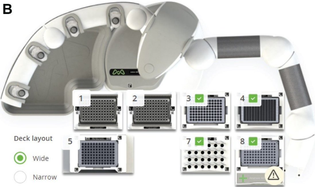
Figure 1. A) Picture of the Andrew+ setup for an 8-sample GlycoWorks RapiFluor-MS protocol. B) OneLab top-down view of the Andrew+ setup for the 8-sample GlycoWorks RapiFluor-MS protocol. Dominos on the automation deck space include: (1) Tip Insertion System Domino fitted with 50 – 1200 \mu L Optifit tips; (2) Tip Insertion System Domino fitted with 10 – 300 \mu L Optifit tips; (3) Storage