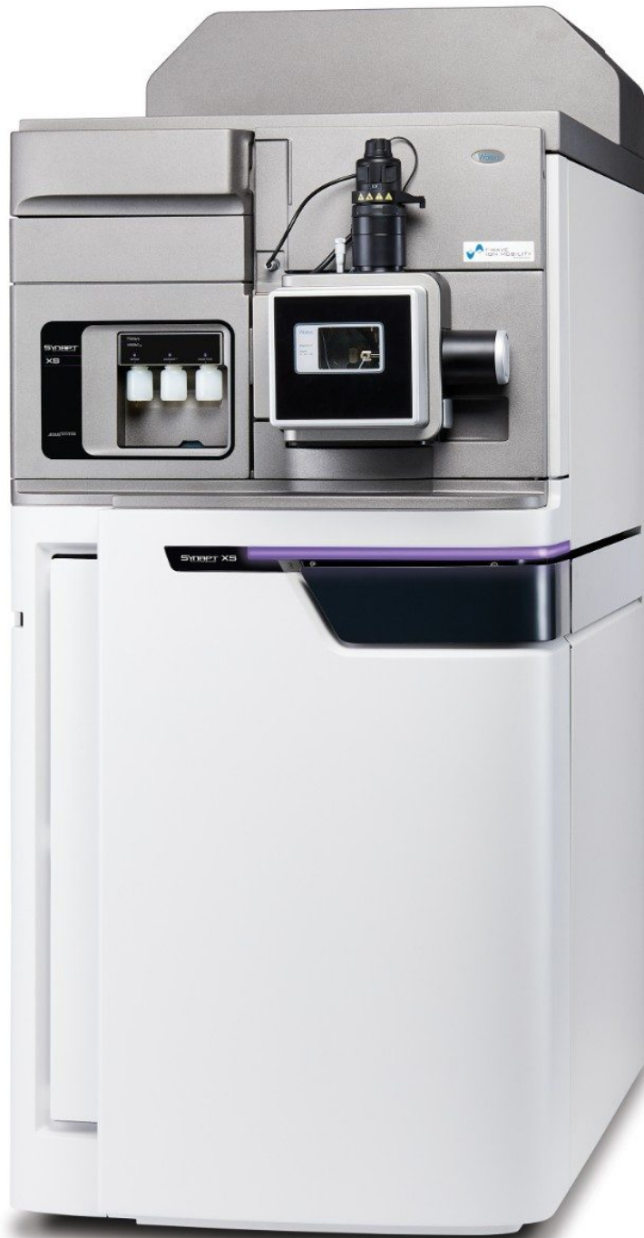
Figure 1. SYNAPT XS Mass Spectrometer.