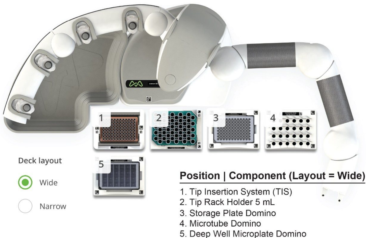
Figure 1. Andrew+ Pipetting Robot deck layout for serial sample dilution and calibration curve generation.

In accordance with small molecule analytical method development guidance, 3,4 a developed assay must be able to demonstrate linearity (correlation coefficient or R^2 \geq 0.98 ), accuracy ( \pm 15\% ), and precision ( \pm 15\% ). These criteria were easily achieved for all six (6) N-nitrosamine impurities using the OneLab sample preparation method executed on the Andrew+ Pipetting Robot and subsequent LC-MS analysis. Mean (N=3) calibration performance is demonstrated in Table 1. For all six N-nitrosamine impurities, linear dynamic ranges were 0.025–50 ng/mL, with linear fits \geq 0.999 using simple 1/x weighting. Additionally, mean accuracy values ranged from 90.7–108.0% with RSDs from 0.2–14.0%, indicating a highly accurate and reproducible method. Representative calibration curves for three of the six nitrosamine impurities are highlighted in Figure 2.