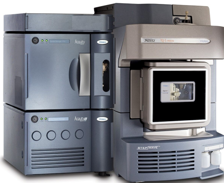
Figure 1. ACQUITY UPLC I-Class/Xevo TQ-S micro System.