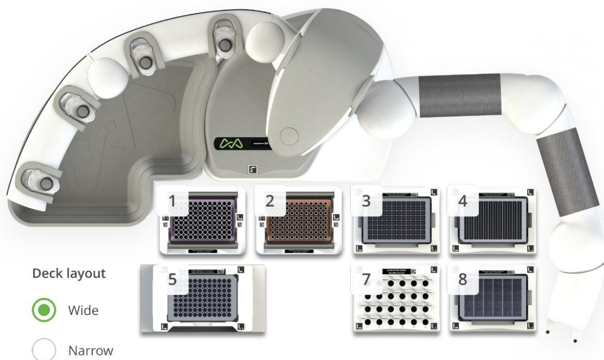
Figure 1. Andrew+ MMA Deck configuration – Dominos: 1 and 2: Tip insertion system; 3,4, and 8: Deepwell microplate; 5-: Microelution Plate Vacuum+; 7: Microtube.

When developing the protocol, improvements were made to the pipette liquid handling parameters to ensure smooth and consistent transfer of samples and thorough mixing within the Ostro Plate before extraction. A user prompt was added to the protocol for the evaporation step which was completed off deck for around 50 minutes. An additional suggestion is that the protocol could be split into two parts at this point to allow use of the Andrew+ in the meantime, if required. The deck configuration for this protocol can be seen in Figure 1.