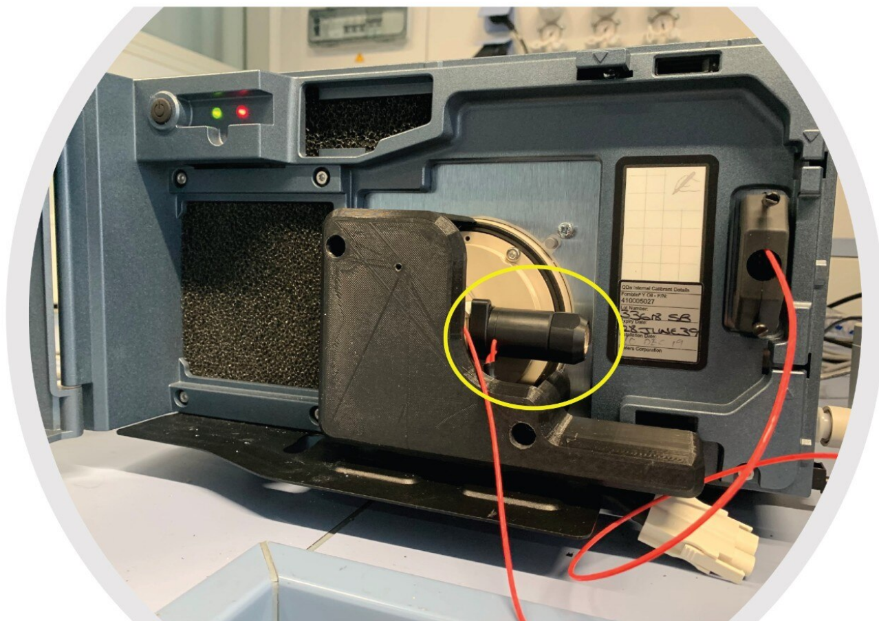
Figure 1. Plasmion SICRIT coupled to a Waters ACQUITY QDa Detector.