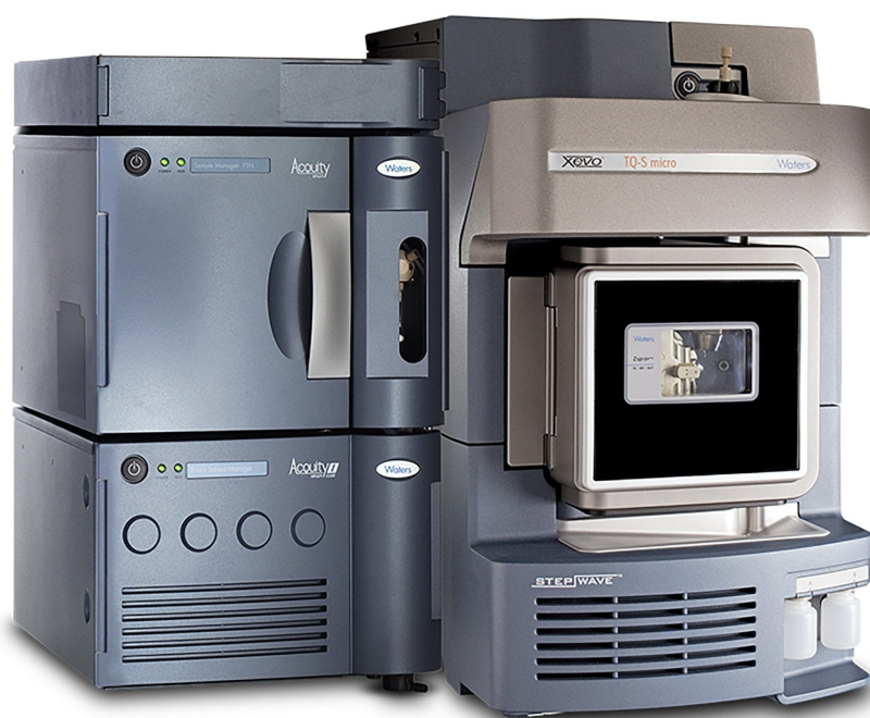
Figure 1. The Waters ACQUITY UPLC I-Class with FL System and Xevo TQ-S micro Mass Spectrometer.

Here we describe a clinical research method using a simple and fast protein precipitation of a small volume of human whole blood. Chromatographic elution using a Waters™ ACQUITY™ UPLC™ HSS C 18 SB Column on a Waters ACQUITY UPLC I-Class with FL System was completed within 1.5 minutes. Simultaneous analysis of all four analytes, followed by detection on a Xevo™ TQ-S micro Mass Spectrometer (Figure 1) was achieved with a time of under two minutes from injection-to-injection.