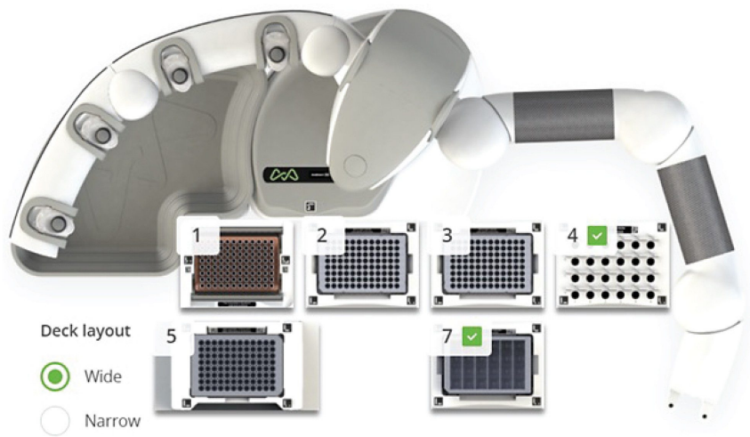
Figure 1. Andrew+ pipetting robot deck layout.