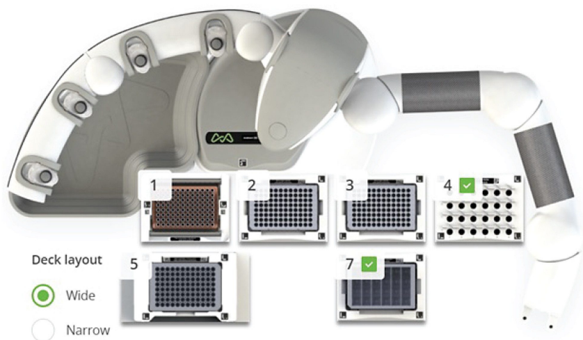
Figure 1. Andrew+ pipetting robot deck layout.

Bioanalysis requires careful method development in order to define working parameters for robust and reliable sample preparation and extraction of compounds. Automating SPE sample preparation development with Andrew+™ pipetting robot enables users to focus on more complex tasks.