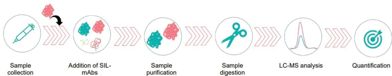
Figure 1. The LC-MS/MS workflow for the analysis of infliximab using the Promise Proteomics mAbXmise Kit ( https://www.mabxmise.com/ ).

The calibrators, QCs and internal standard provided in the mAbXmise kit were used to demonstrate proof of performance, with calibrators ranging from 2–100 µg/mL and QCs at 4 and 25 µg/mL. In addition, analysis of 29 IFX plasma samples enabled comparison between different IFX signature peptide concentrations from the analysis.