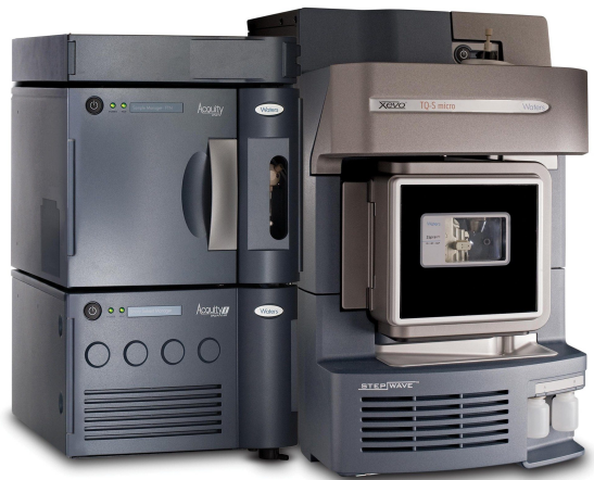
Figure 1. Waters ACQUITY UPLC I-Class Plus system and Xevo TQ-S micro.